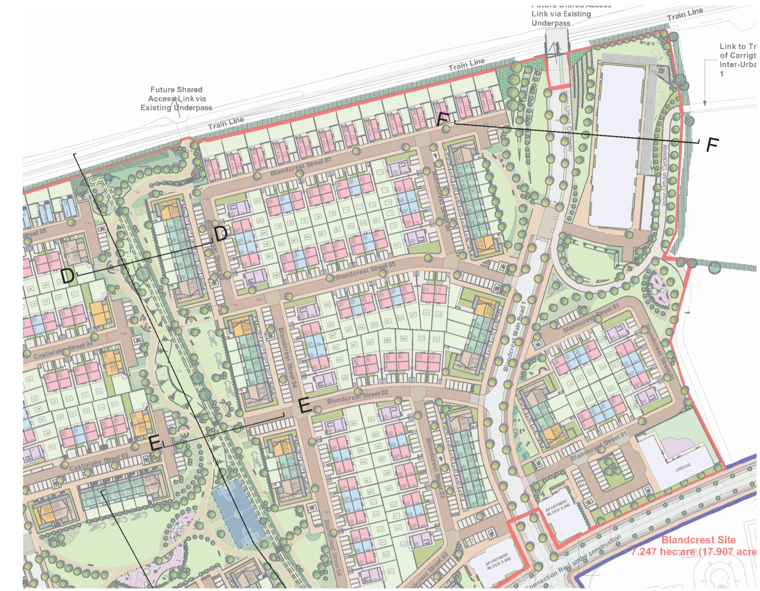
Central Neighborhood Park & Blandcrest North Site